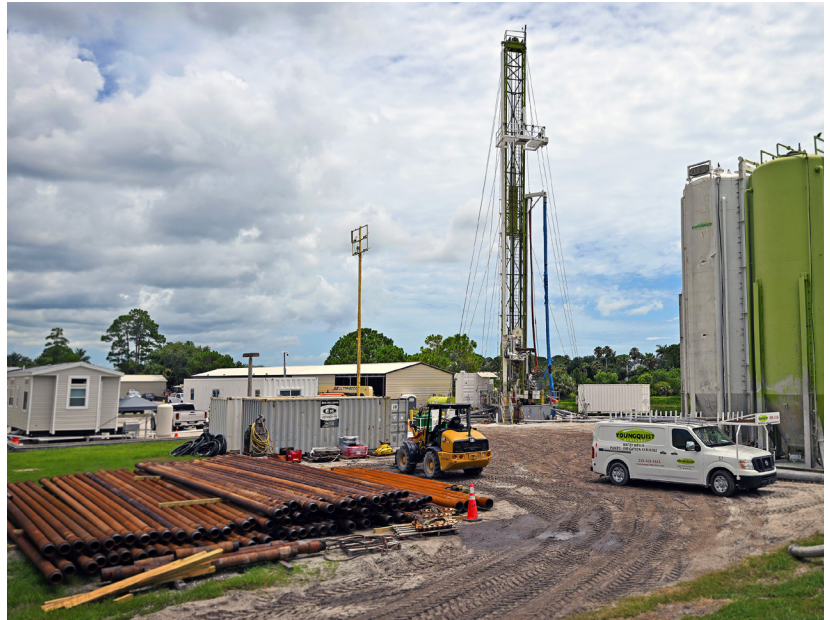
SLWSD's 2nd Class I Injection Well construction site, located at 450 SW Utility Dr.

Class I injection wells are deep, federally regulated systems used to dispose of reverse osmosis reject water. These wells inject the concentrate thousands of feet underground into confined rock formations well below drinking water sources, offering a long-term, environmentally responsible disposal solution.